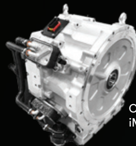
Cascadia Motion iM-425